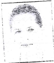
Smt. Sonia Gandhi Prime Minister, India