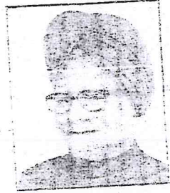
Dr. Manmohan Singh Prime Minister, India