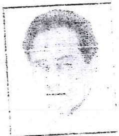
Shri Kamal Nath Union Minister, Urban Development