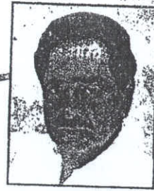
Shri Kamal Nath Hon'ble Minister of Urban Development