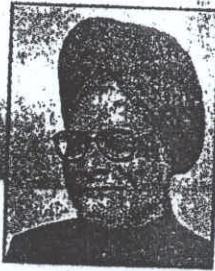
Dr. Manmohan Singh Hon'ble Prime Minister