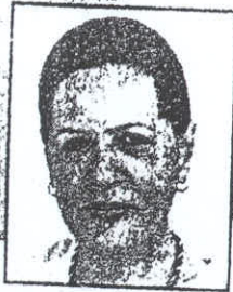
Smt. Sonia Gandhi Hon'ble Chairperson, UPA