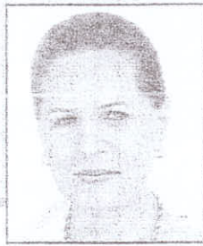
Smt. Sonia Gandhi Hon'ble Chairperson, UPA