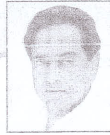
Shri Kamal Nath Hon'ble Minister of Urban Development