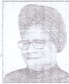
Dr. Manmohan Singh Hon'ble Prime Minister