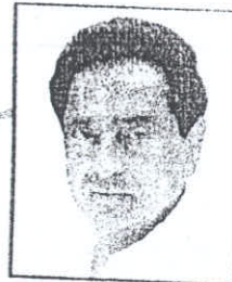
Shri Kamal Nath Hon'ble Minister of Urban Development