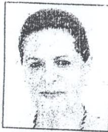
Smt. Sonia Gandhi Hon'ble Chairperson, UPA