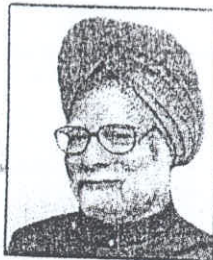
Dr. Manmohan Singh Hon'ble Prime Minister