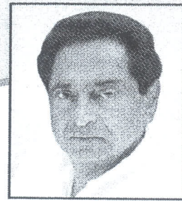
Shri Kamal Nath Hon'ble Minister of Urban Development