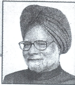
Dr. Manmohan Singh Hon'ble Prime Minister