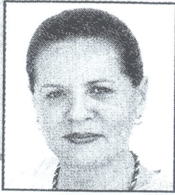
Smt. Sonia Gandhi Hon'ble Chairperson, UPA