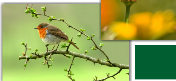
Some fascinating sightings at the Aravali Biodiversity Park.