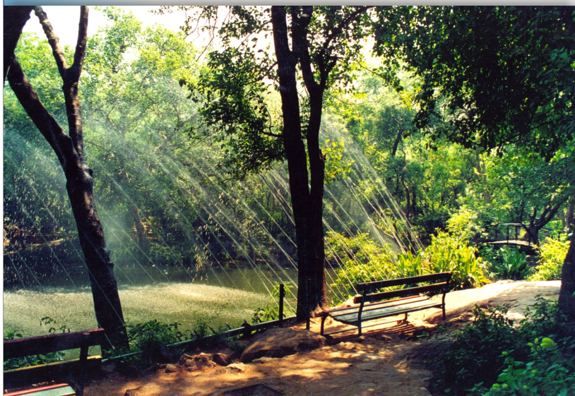
A quiet section for introspection in Swaran Jayanti Park.

Rs. 150.00 crore has been earmarked for Common Wealth Games and Rs.150.00 crore for specified Housing under BGDA.