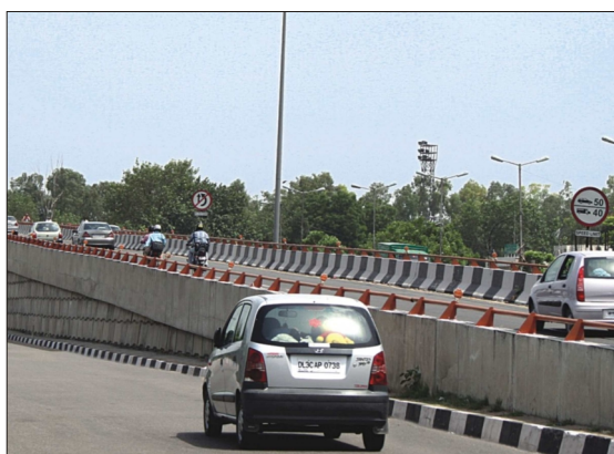
Flyover at Wazirpur Depot.