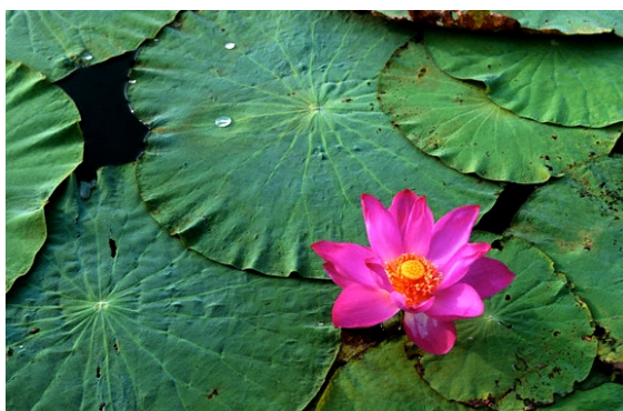
Water Lily blooming in full glory in one of the artificial lakes developed by DDA.

The site under reference is Recreational area