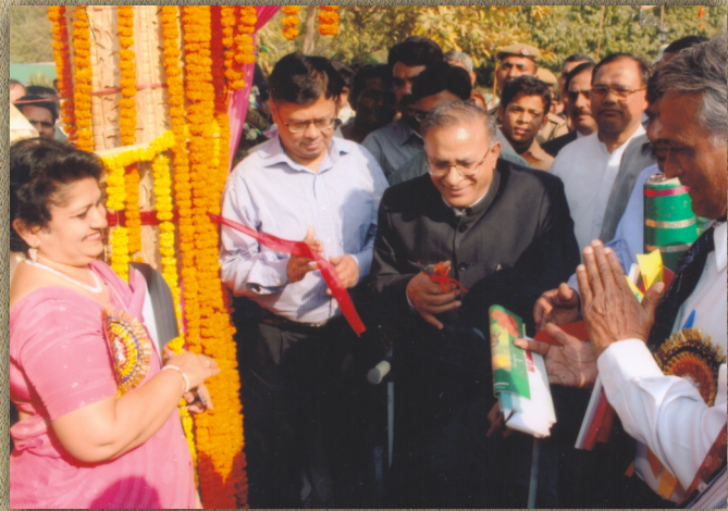
Sh. Jaipal Reddy, Union Minister of Urban Development inaugurating the 'Flower Show' organised by DDA at Swam Jayanti Park, Rohini.