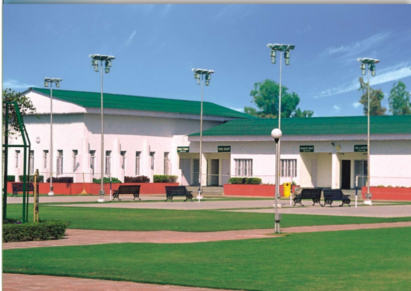
Facility Block & Badminton Courts at Chilla Sports Complex.

groups in individual sports like tennis, squash, badminton, table tennis and billiards are held in the sports gala. It gives an opportunity to the members and dependants of the complex to participate at an amateur level to try and excel in the particular discipline. Alongwith the sports gala, an invitational tournament for schools in team games, such as cricket, basketball, hockey, football was also organized at each sports complex.