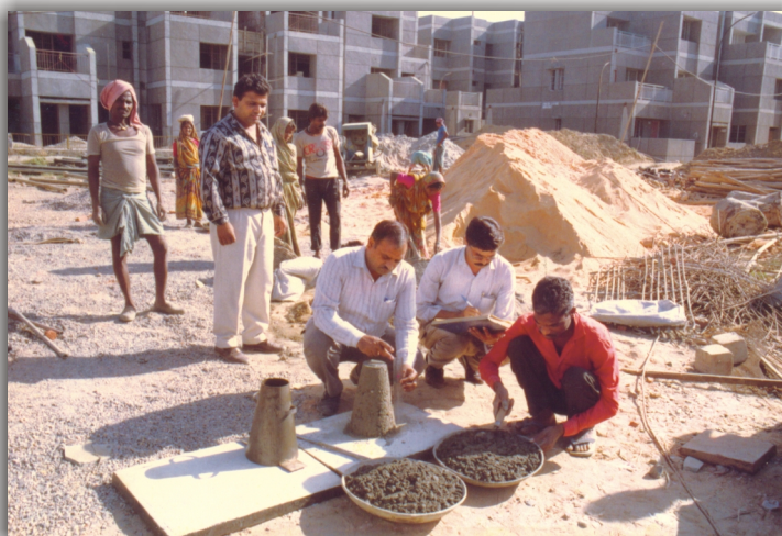
Quality check in progress by Quality Assurance Cell.

The reduction in number of tests in Quality Assurance Lab is due to the fact that at least 10% of the tests are being got conducted from the other external approved labs, which was not mandatory earlier.