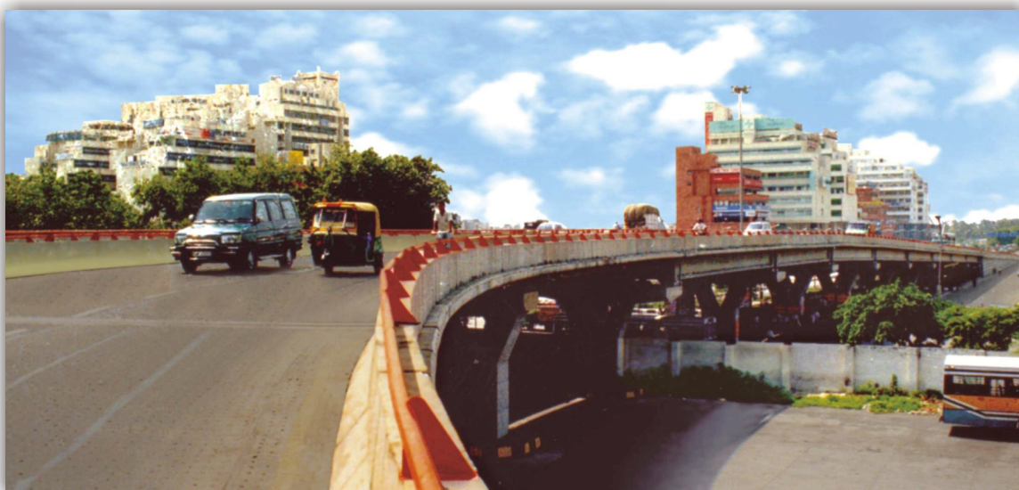
Flyover at Bhikaji Cama Place.

The references of Supreme Court / High Court Monitoring Committee regarding unauthorized constructions, misuse and encroachments on public land dealt in a time bound manner.