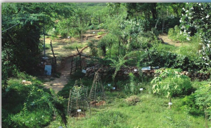
Nurturing greenery in Aravali Biodiversity Park.