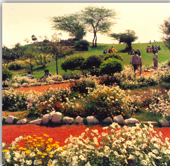
Eloquent landscaping by DDA at Jamali Kamali.

On the demise or loss of a DDA employee due to an accident or loss of a limb due to accident, the cases of PAIP are also dealt with in GIS branch. The complete case alongwith claim form, death certificate, FIR, Post Mortem Report etc. as per check list is sent to GIS branch for onward transmission. The documents are scrutinised in GIS