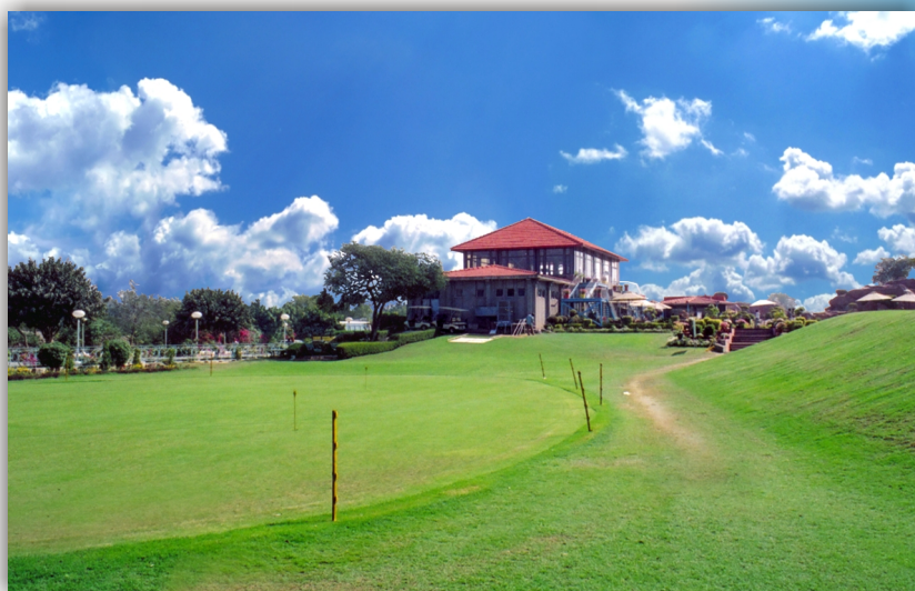
Golf Course at Iado Sarai.