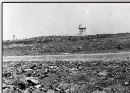
▲ Then, before DDA planning & development. Nehru Place

Now, developed as per Master Plan 2001. ►