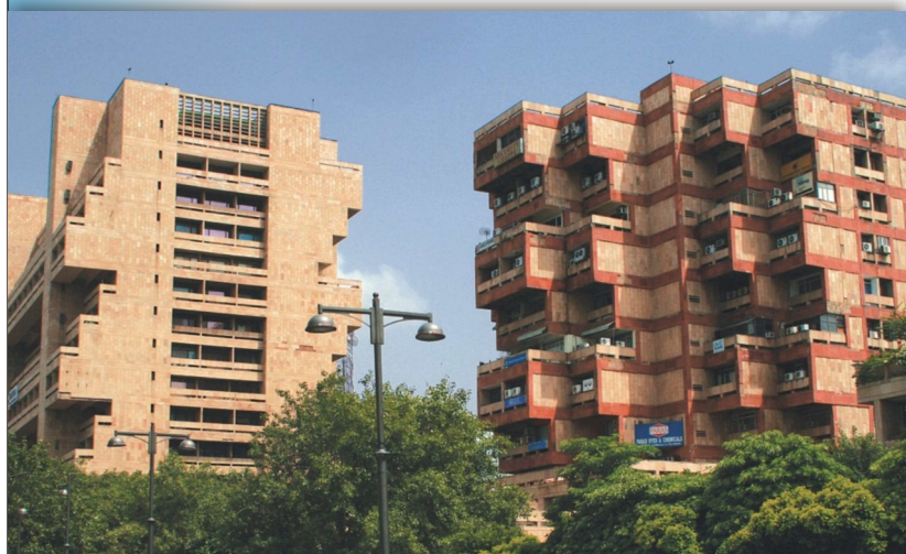
Bhikaji Cama Place District Centre.