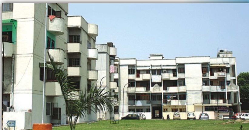
SFS Flats at Rohini, Sector - 18.