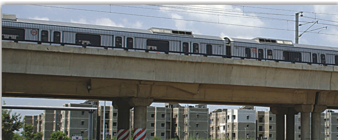
Metro passing Dwarka.