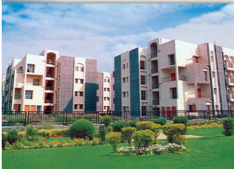
New age DDA flats at Dwarka.

There were 14 Refugee Camps, where 237 Kashmiri Migrants are / were staying. The details are as under :-