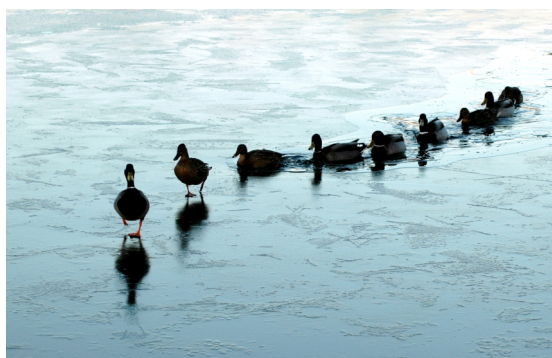
Follow the leader. A scene at a DDA developed water body.

An approx 1.8 k.m. stretch of Nala from F Block to I Block, Lajpat Nagar, with width 12 to 14 m is presently an open drain which will be covered, and area above will be used for Jogging, relaxing etc. A jogging track for joggers, sitting / relaxing area for shoppers with planters & shaded areas accentuating the access would be provided.