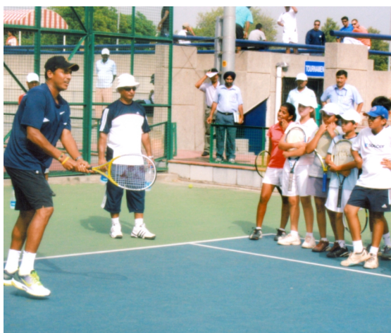
Ace Tennis Star Mahesh Bhupathi in a coaching session at Siri Fort Sports Complex.