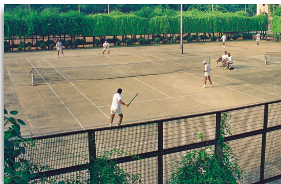
A game of Tennis in progress at Rohini Sports Complex.