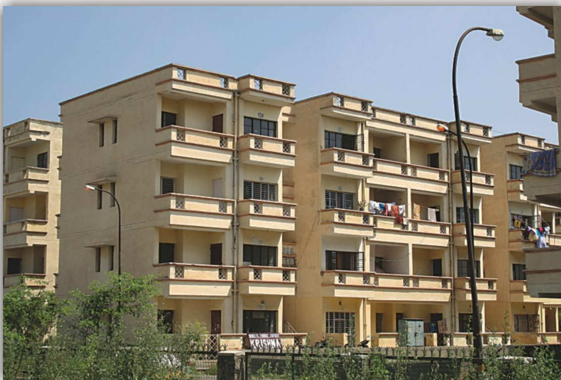
Modern row houses by DDA in Dwarka.

Introduction of standard formats for reporting and monitoring of cases referred.