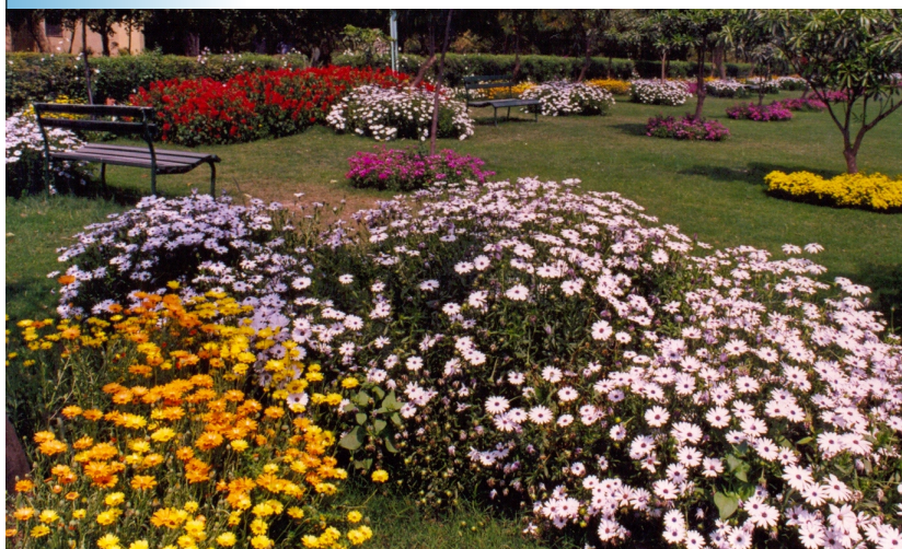
Blooming flowers in a riot of colours in a DDA park.

DD - II is a member of a committee where in report on B.O.T. facility is to be prepared. DD - I & DD - II are also member of core-group for Common Wealth Games Village & venues. Contribution is also towards planning of Urban Villages, Adoption of Park scheme.