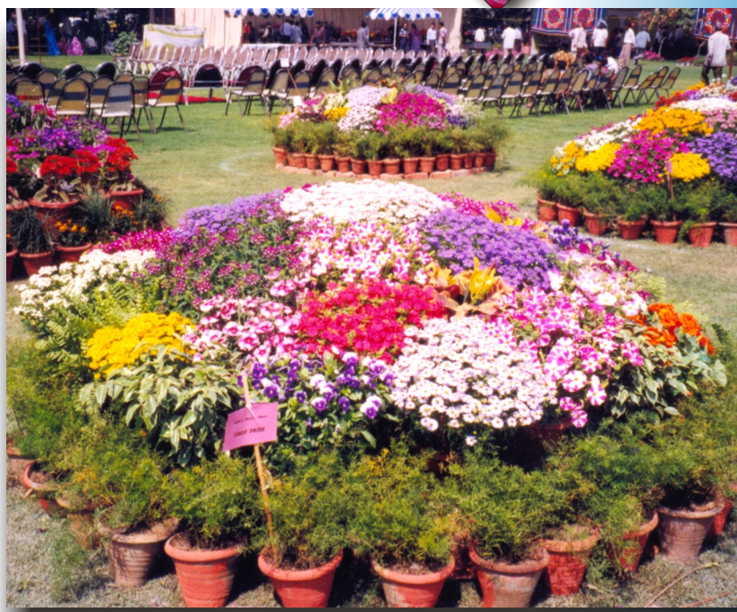
Displays in Annual Flower Show organised by DDA.

During the year a massive plantation drive was launched by involving school children, senior citizens and Ministers/ MLAs and MPs. A Flower Show was also organised successfully by the Horticulture Department, DDA in the month of March, 2008.