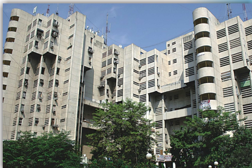
Janak Puri District Centre.